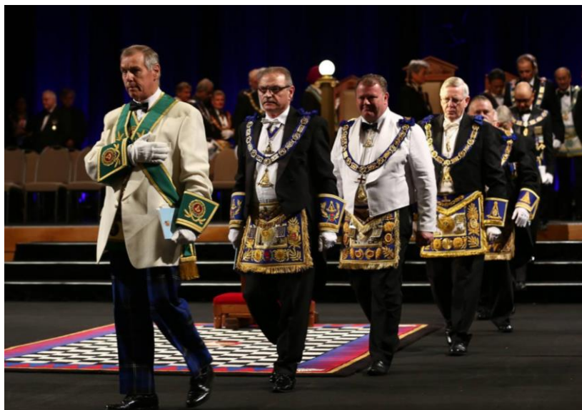
Grand Lodge of Scotland leading all visiting Deputations from Grand Lodge