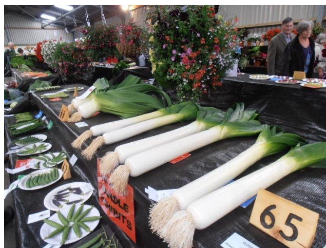
Winning leeks at the Black Isle Show