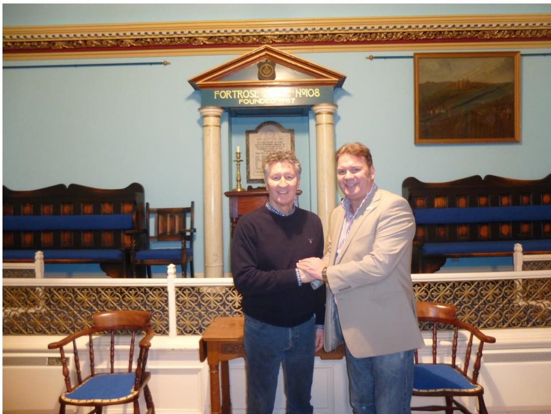
We had a visit in January from two famous Rangers Brethren, Derek Parlane (left) and Derek Johnstone, (right) they had asked to visit the Lodge and were truly struck by its magnificence.