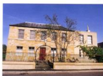
Lodge Fortrose No 108