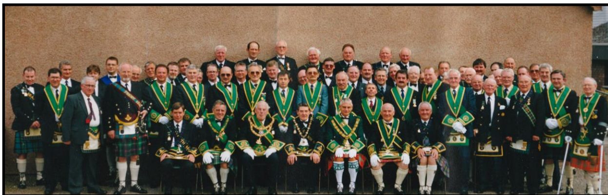
Lodge Seaforth and Provincial Grand Lodge Members at Centenary Celebrations June 1997

The Lodge shall be marking its 125-year anniversary on 8th May 2022, and during discussions regarding planning for celebrations to mark the milestone anniversary, it was noted that it was almost twenty-five years since the Lodge Members assembled together for a group photograph, the last photograph being taken at the Centenary Celebrations in June 1997 -