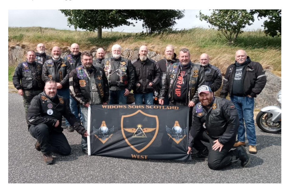
Visiting Callanish Stones