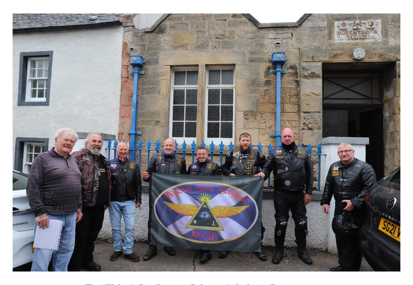
The "Widow's Sons" visiting Robertson's Lodge in Cromarty