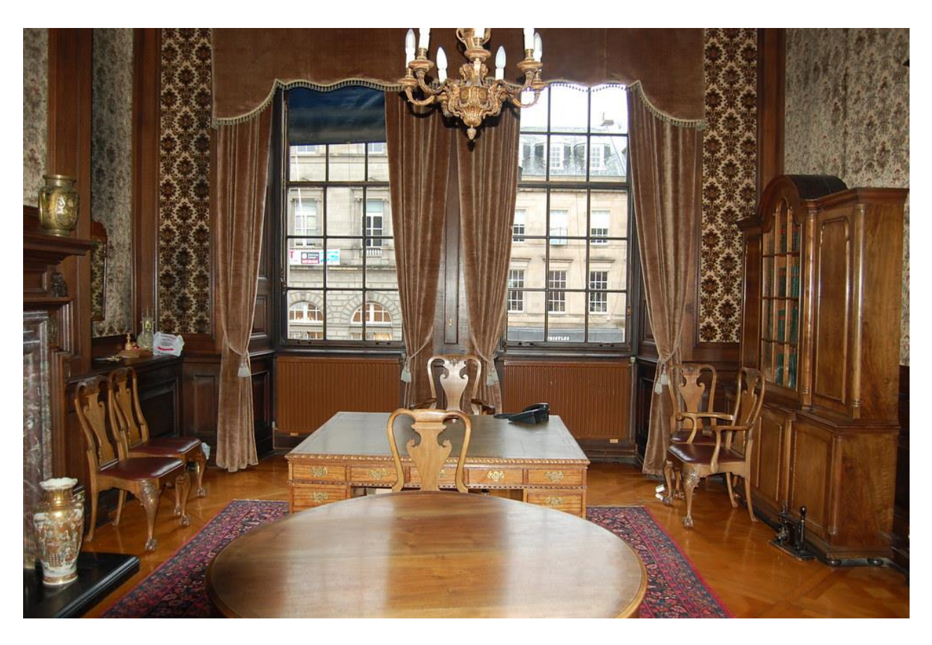
The Grand Master Masons' Office in 96 George Street, Edinburgh