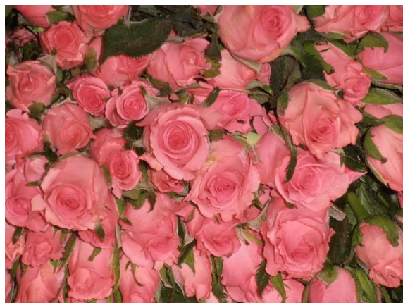
A selection of roses seen at the Rose Farm we visited whilst at Navaisha