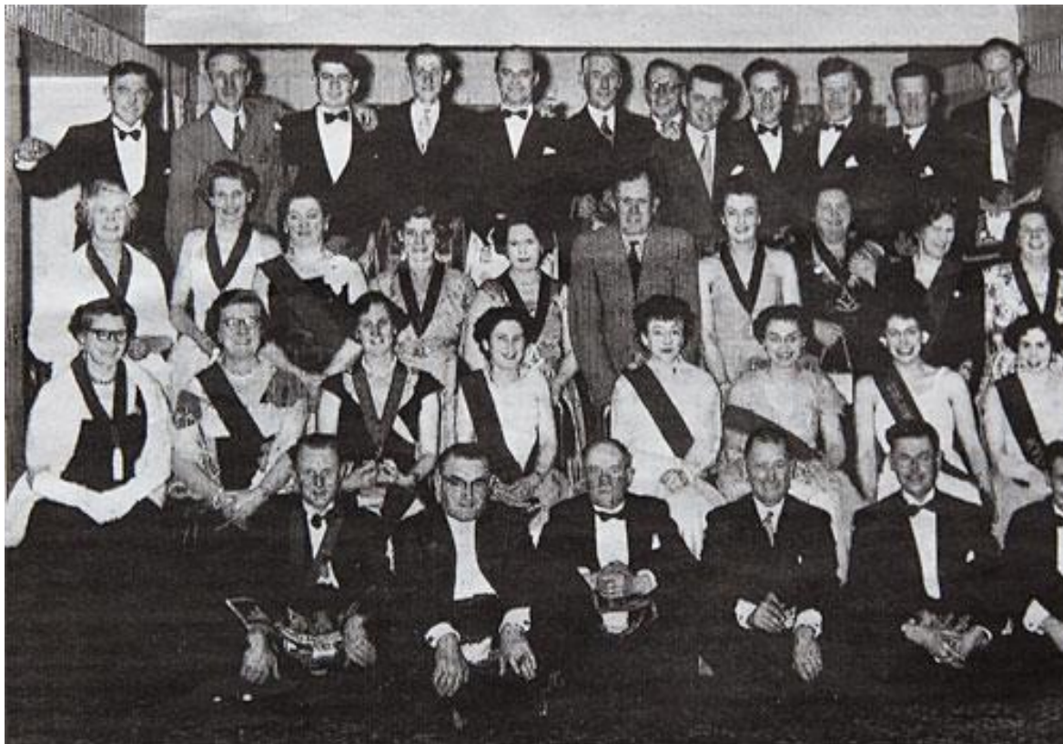
SNIPPETS FROM THE PAST – Lodge Kyle – circa 1950