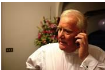
Guess who could not find his tie?