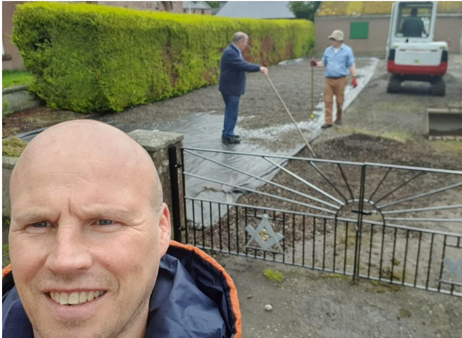
Every good job needs a gaffer!