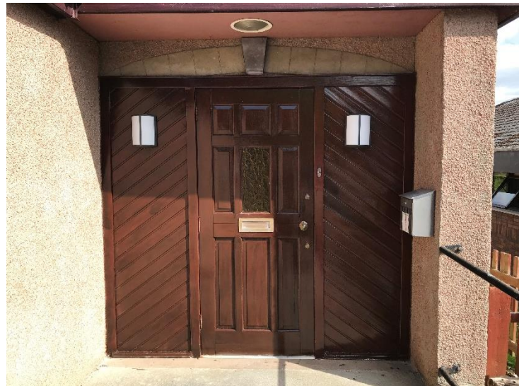
The spruced-up entrance to Lodge Seaforth