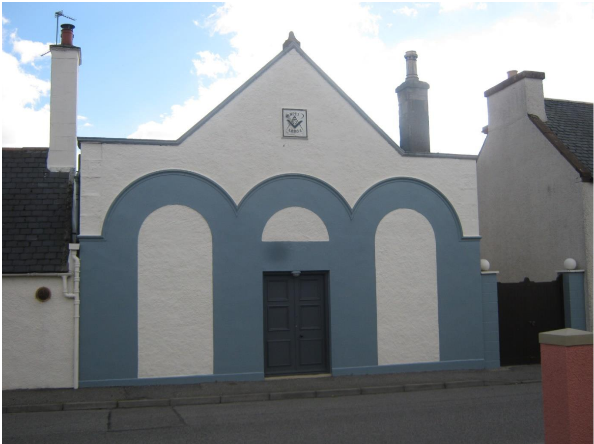
Lodge Ness No 888, Invergordon

The Quarterly Newsletter of the Province of Ross and Cromarty