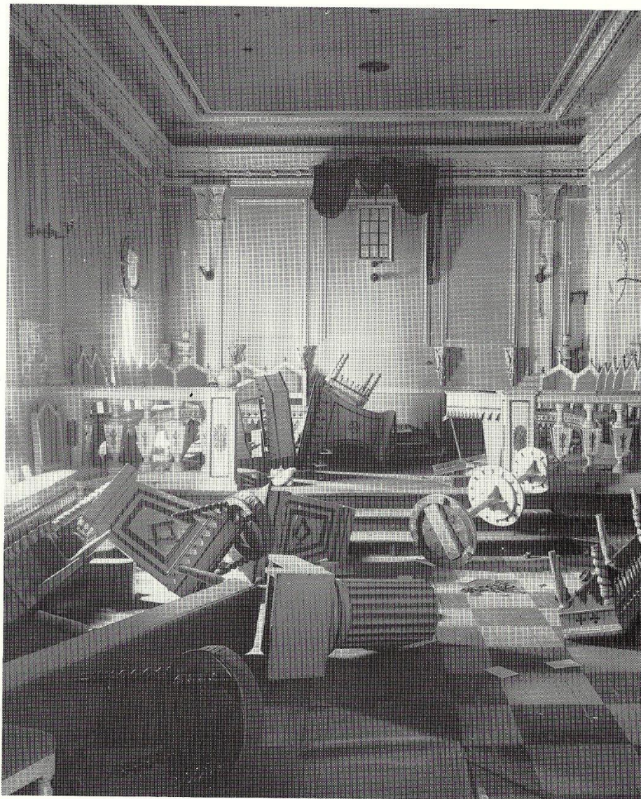
Temple maçonnique dévasté sous l'Occupation.

Peter also sent me a timely reminder that Freemason's also suffered at the hands of the Nazi occupation of France. The following picture depicts a French Lodge trashed by the Nazi occupation forces –