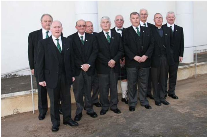
Left: The Provincial Office-bearers just before we started the three ceremonies

All in all, the trip was excellent – thoroughly enjoyed by all who participated. There will be a fuller report available soon with far greater detail than is present in this article. I would finish by simply thanking everyone for their generosity, friendliness and hospitality – I can assure you – it was greatly appreciated.