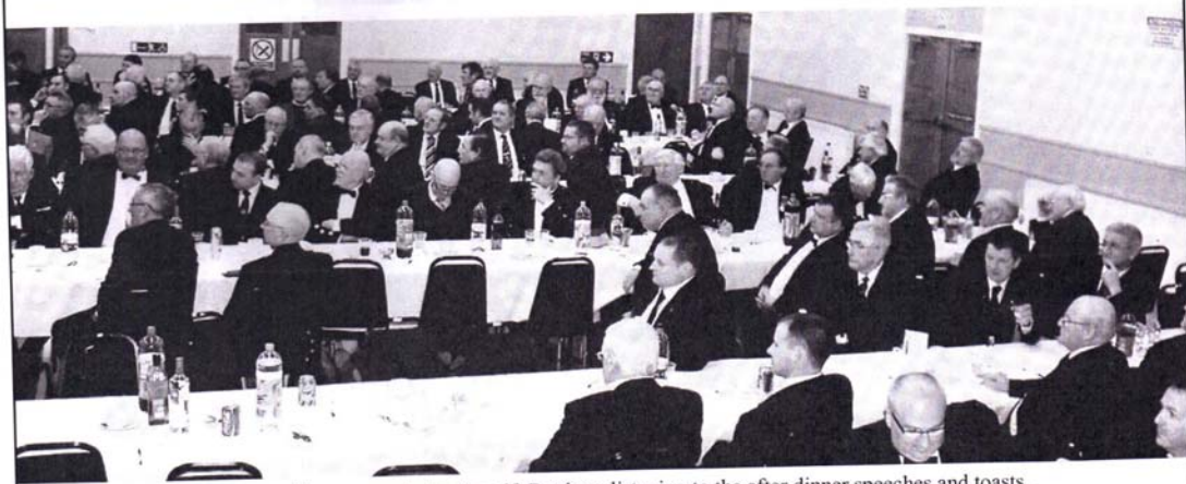
Attentive audience - speaks for itself. Brethren listening to the after dinner speeches and toasts.