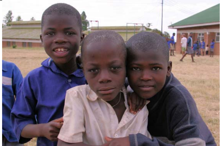
Below: Some of the inhabitants along the banks of the River Shire