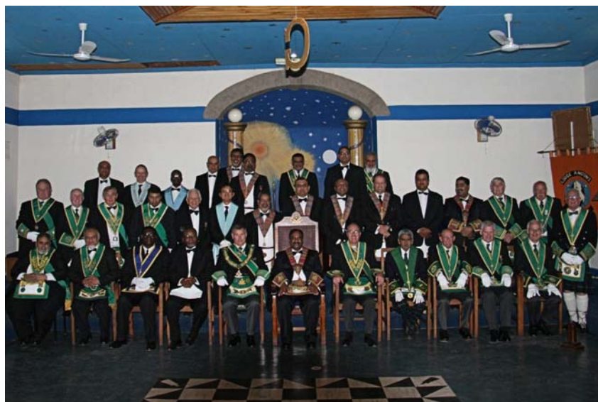
The Provincial Grand Lodge Deputation at Lodge Angoni where they witnessed an excellent EA Degree

I think this is the first time we have reached thirty pages – my sincere thanks to all who have contributed.